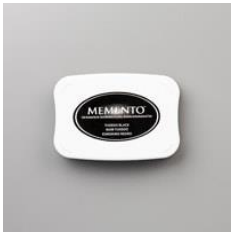
Tuxedo Black Memento