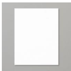
Basic White 8 1/2" X 11"

Since you are cutting cardstock, you will now need a Paper Trimmer and some adhesive to put the layers together. Just adding these layers gives your cards a whole new look!