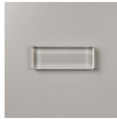
Clear Block H