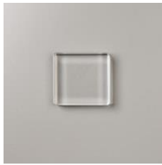
Clear Block D