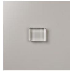
Clear Block B