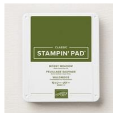
Mossy Meadow Classic Stampin' Pad