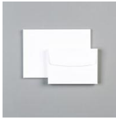
Basic White Note Cards &