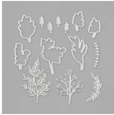
Forever Flourishing Dies

Note: There are coordinating dies available for the Forever Fern Stamp Set. To use them, you will also need the Stampin' Cut & Emboss Machine.