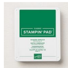
Shaded Spruce Classic Stampin' Pad