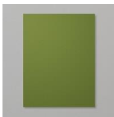
Mossy Meadow 8-1/2" X