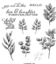
Forever Fern Cling Stamp