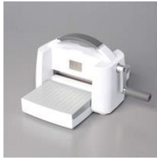
Stampin' Cut & Emboss