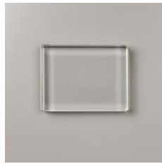
Clear Block E