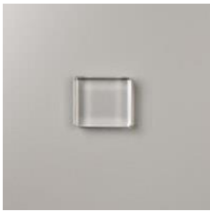
Clear Block C