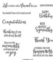
Peaceful Moments Cling Stamp Set (English)