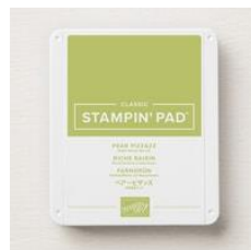
Pear Pizzazz Classic Stampin' Pad